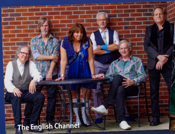
The English Channel